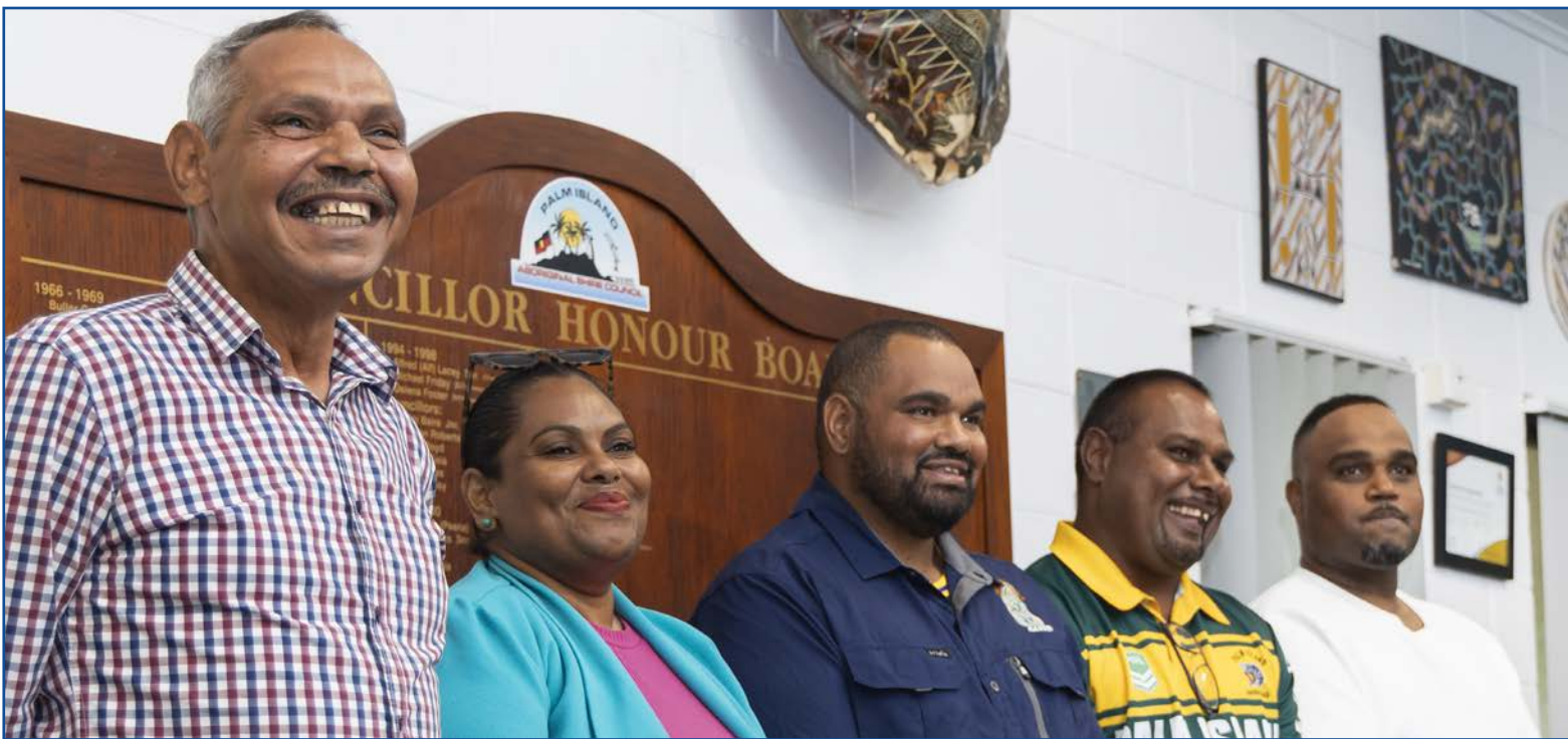
The newly elected Councillors in April, 2024.

Palm Island Aboriginal Shire Council has held its January Ordinary Council Meeting and continues work to strengthen services, improve infrastructure and plan for Palm Island's long-term future.